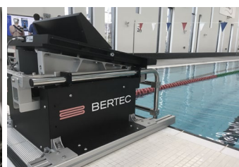
INSTUMENTED STARTING BLOCK